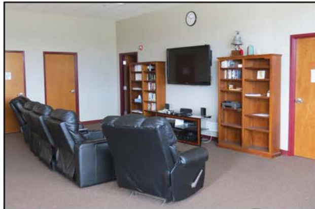
Firefighter's lounge area

For further information, visit: New Hope Eagle Volunteer Fire Company 46 North Sungan Road PO Box 314 New Hope, PA 18938 215.862.2692 www.eaglefirecompany.org