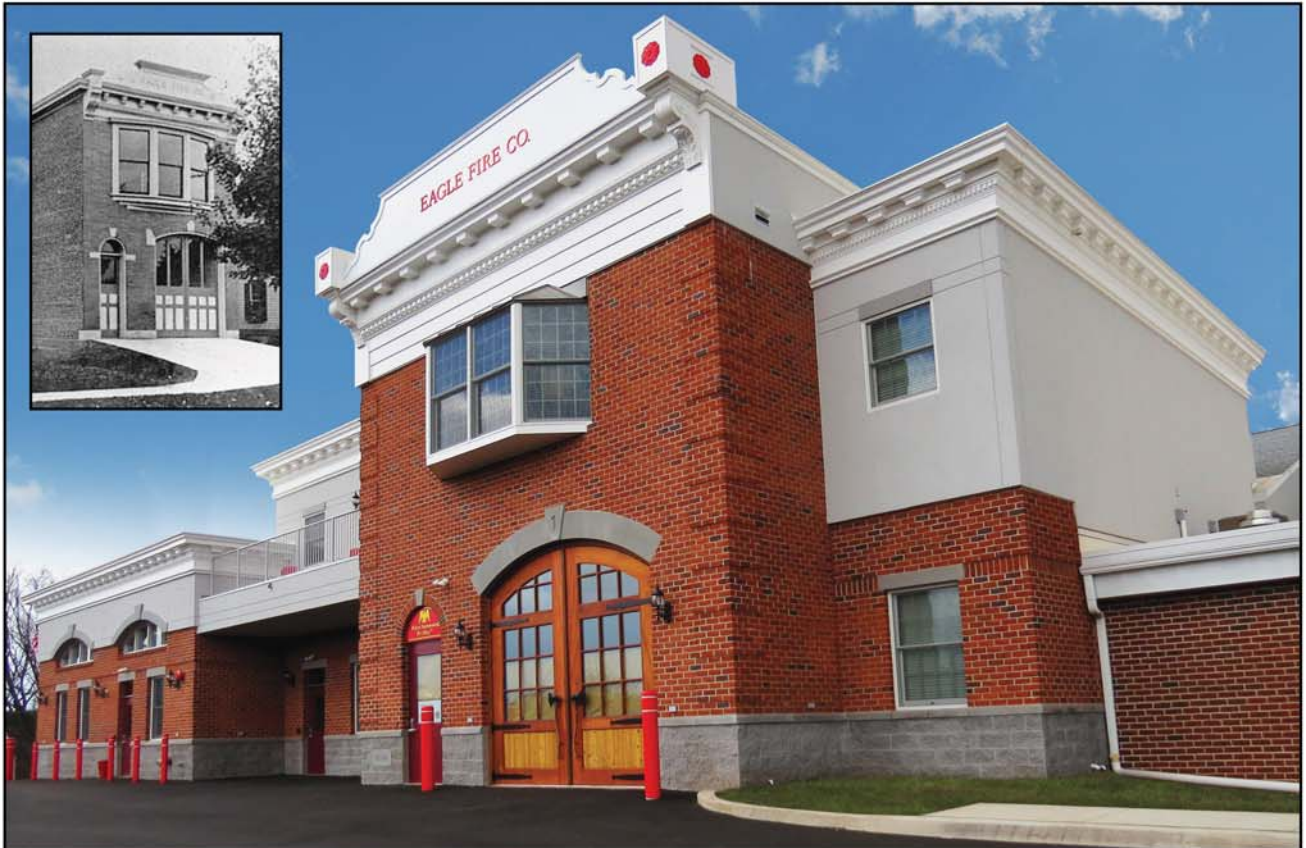
New Hope Eagle Fire Company stands as the oldest in Bucks County, Pennsylvania. The two story addition replicates the fire house (inset) that the Company occupied for the first two thirds of the twentieth century.

lobby and exterior roof canopy began May 2012.