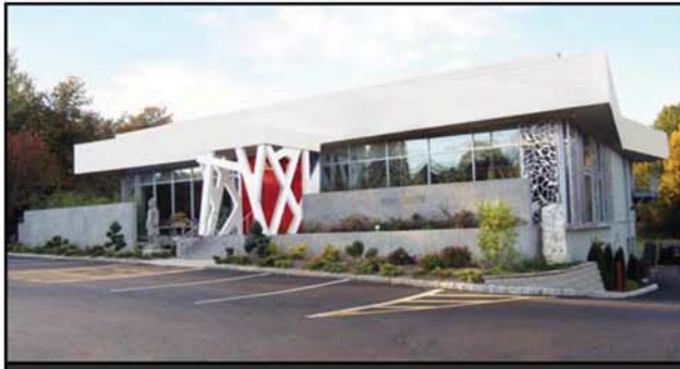
EIFS and poured concrete exterior finishes are offset by a distinctive portal designed to have the look of a Corian finish.

In the late spring and early summer of 2007 we delivered three very different projects. Those projects were Peking Pavilion, an upscale Chinese restaurant in Manalapan, New Jersey, Gamesa Wind in the U.S. Steel Industrial Park in Fallsington, PA and the new Faulkner Cadillac dealership in Bensalem, PA.