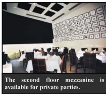
The second floor mezzanine is available for private parties.