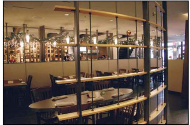
A variety of dining venues are available from the first floor bar area shown above, to quieter areas on the second floor.