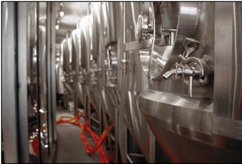
Mature beer is pumped to the tanks above, part of a 15 barrel brewing system, and delivered to the bar taps below.