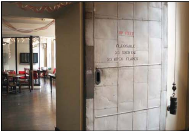
A fire door salvaged from the construction site at U.S. Steel now serves as a unique divider between dining areas.

So it followed that when Triumph selected the site for their second location in George Michael's Union Square in New Hope, PA., we were chosen once again to be the contractor. In this case we had two separate contracts. The first was with George to complete the demolition and renovations of the shell building and the second was with Triumph to complete the interior of the Brew Pub/Restaurant. It was once again a challenging job, with a contemporary design, exotic finishes and a very complicated mechanical system including a multi-zone VAV climate control system. All of this adapted to the interior of a nineteenth century industrial building. John, with strong encouragement from our customer, once again chose Jeff Bertoldo as our project superintendent. The job was done on time and to the highest standard of quality. In September of 2004, we proudly showed off the new restaurant to customers, friends and design professionals with whom we work.