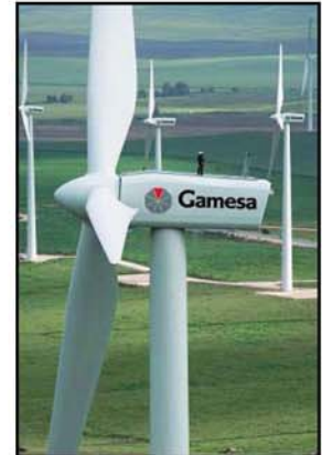
Gamesa Wind's turbine towers stand at approximately 250' to 300' with three 138' blades.

Our work at Gamesa Wind included building offices and other renovations for the world's second largest manufacturer of electricity generating windmills. Gamesa Wind intends to supply not only the U.S. from this location, but also the balance of the Western Hemisphere, thus making Pennsylvania a leader in wind production east of the Mississippi.