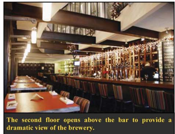
The second floor opens above the bar to provide a dramatic view of the brewery.