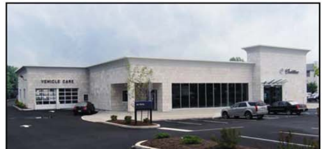
Faulkner Cadillac's "Vehicle Care Center" consists of a fully stocked parts area and 15 service bays.

Facility Image Program. These specifications include upscale interior finishes consistent with the name and brand of "Cadillac". The building exterior is a stately