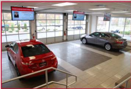
New car delivery