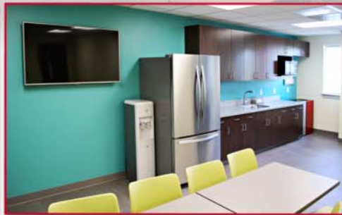
Employee lunch room