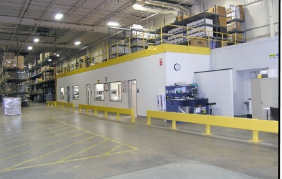
An interior view of the warehouse