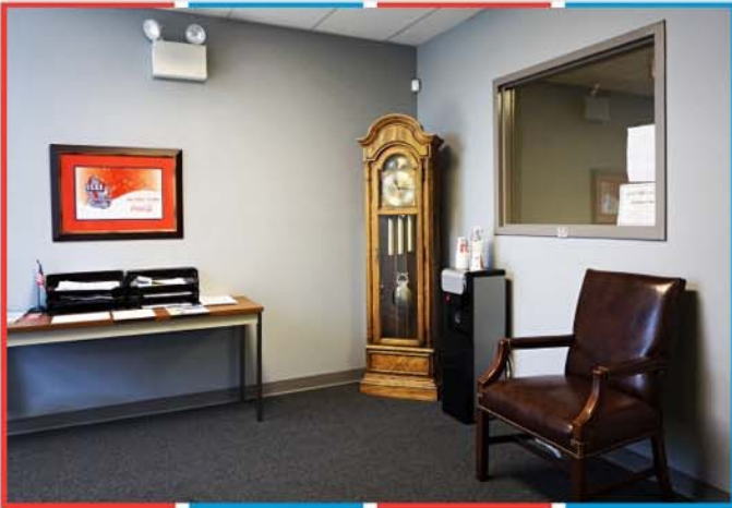
New lobby entrance with one way glass