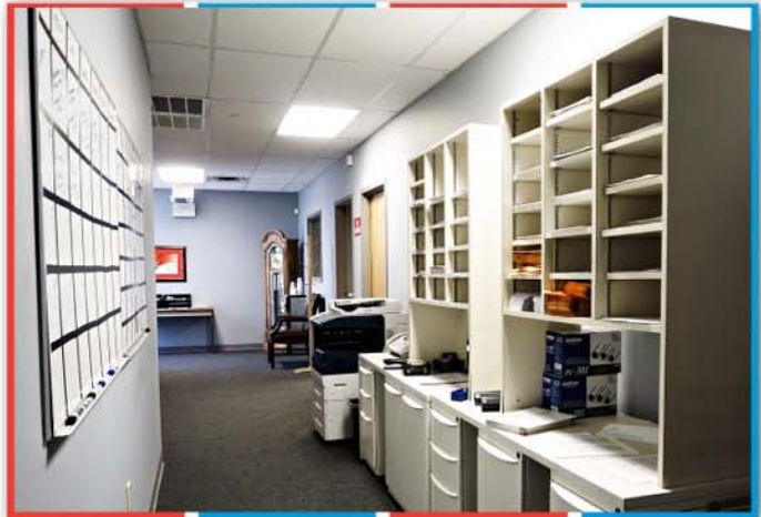
Hallway leading to testing lab