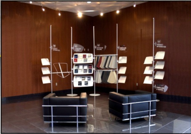
Above: An interactive Product Information Center allows customers to browse interior and exterior options of the highly versatile Cadillac.

Faulkner Cadillac's new home, built in accordance with Cadillac's new Image Program, was built from the ground-up and includes a showroom, parts area and 15 service bays. The elegant and luxurious style of the Cadillac brand is reflected through a limestone paneled exterior and an entry way protected by a stainless steel framed glass canopy which leads into a modern showroom surrounded by distinctive glass enclosed office spaces and wood grain vinyl wallcoverings.